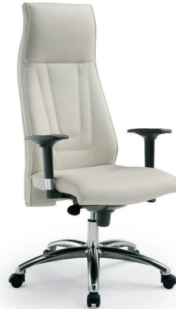
SPHERA EXECUTIVE CHAIR